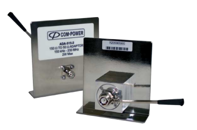
ADA-515-2 Adapter Set